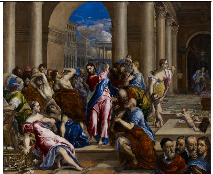
Christ Driving the Moneychangers out of the Temple, El Greco 1570

Candidates for the Sacraments, The Needy and Hungry of the World, Women's World Day of Prayer, Survivors of Sexual Abuse, Penitents and Wanderers