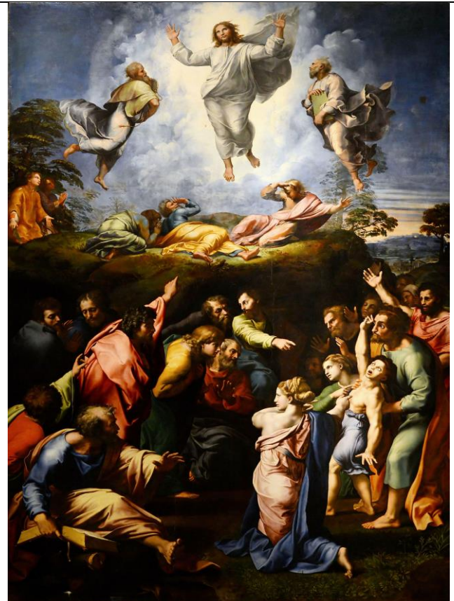
The Transfiguration, Raphael 1516-1520