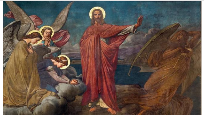
Forty Days in the Desert