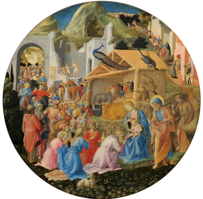
The Adoration of the Wise Men, Fra Angelico 1440

Openness to the Word of God, Migrants and Refugees, Expectant Mothers