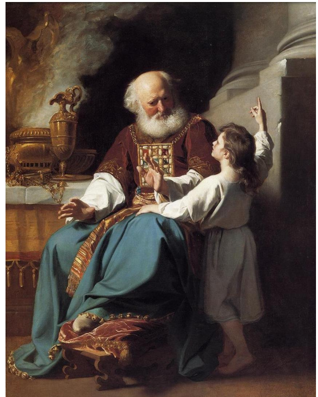
Eli and Samuel, John Singleton Copley, 1780