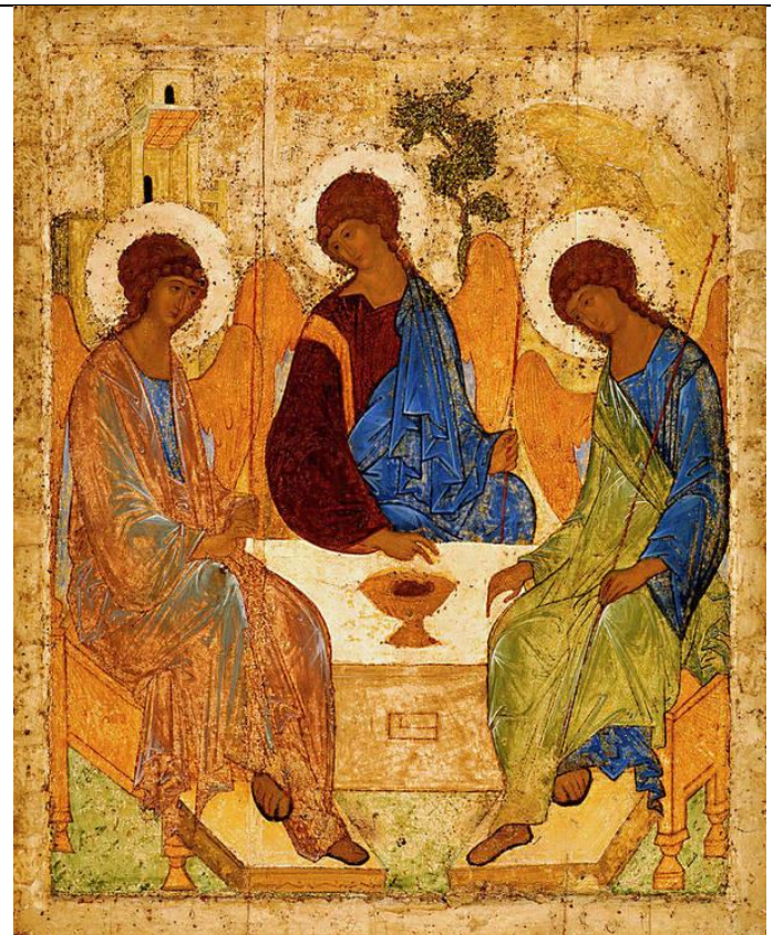
The Trinity, Andrei Rublev 14th Century