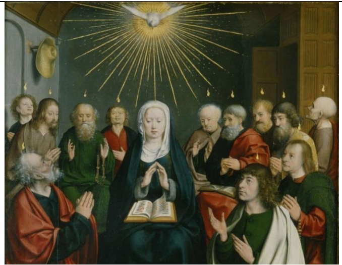
Pentecost, Jan Joest van Kalkar (1450-1519)