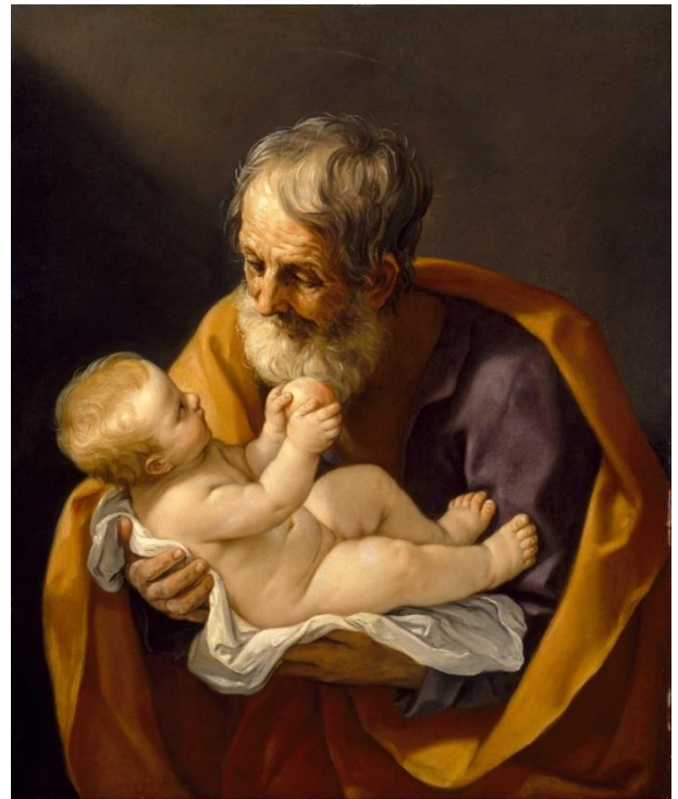
St Joseph and the Christ Child, Guido Reni (1575–1642)