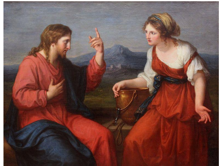
Christ and the Samaritan Woman at the Well, Angelica Kauffman, 1796