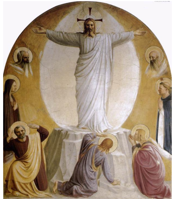
The Transfiguration, Fra Angelico 1440-42