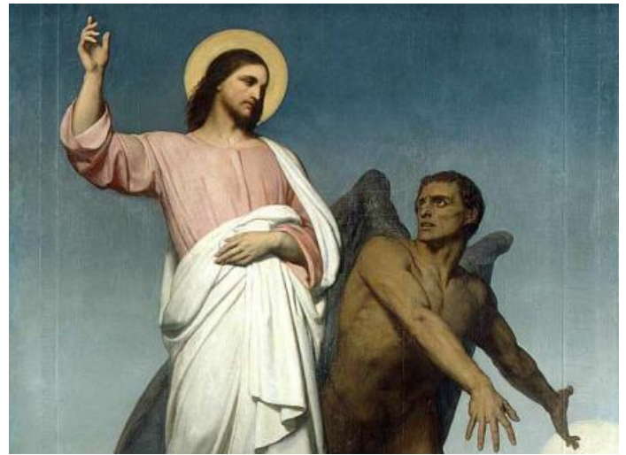
The Temptation of Jesus in the Desert