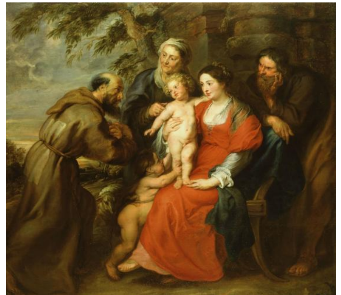
The Holy Family with Saint Francis, Rubens 1620-30