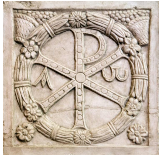
The Chi Rho Symbol from an Early Christian Sarcophagus, Vatican Museum

New Members of the Church, Vocations, Human Work, The Right Use of the Media, The Church