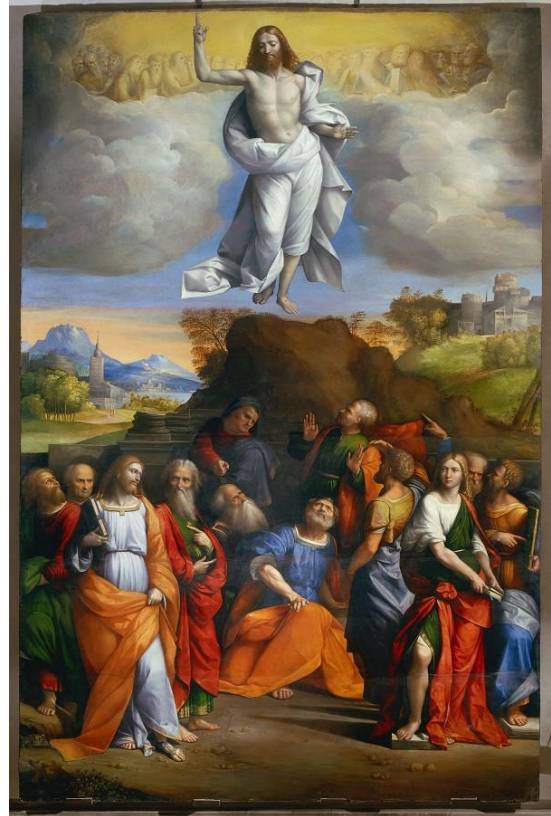
The Ascension of the Lord