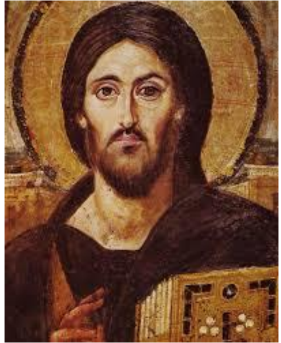
I am the Way, the Truth and the Life