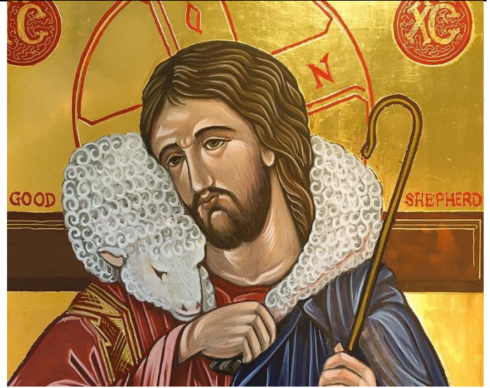
The Good Shepherd