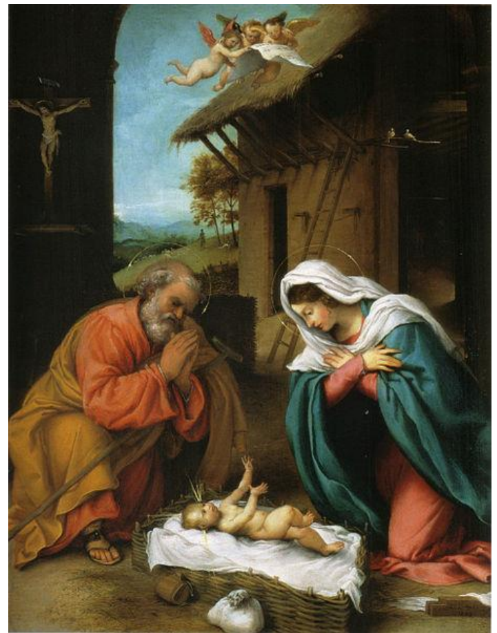
The Nativity, Lorenzo Lotto, 1523