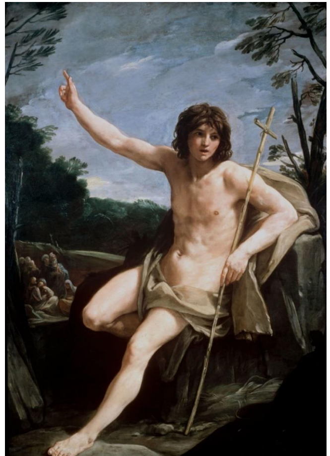
St John the Baptist in the Wilderness, Guido Reni 1636-7