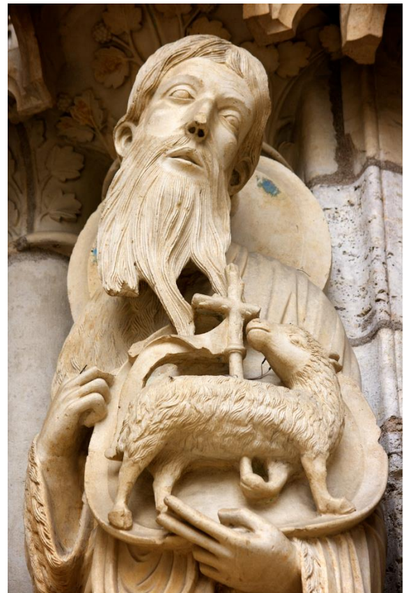
St John the Baptist, Chartres Cathedral (13th Century)