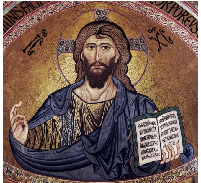
Pantocrator, Cefalù Cathedral, Sicily