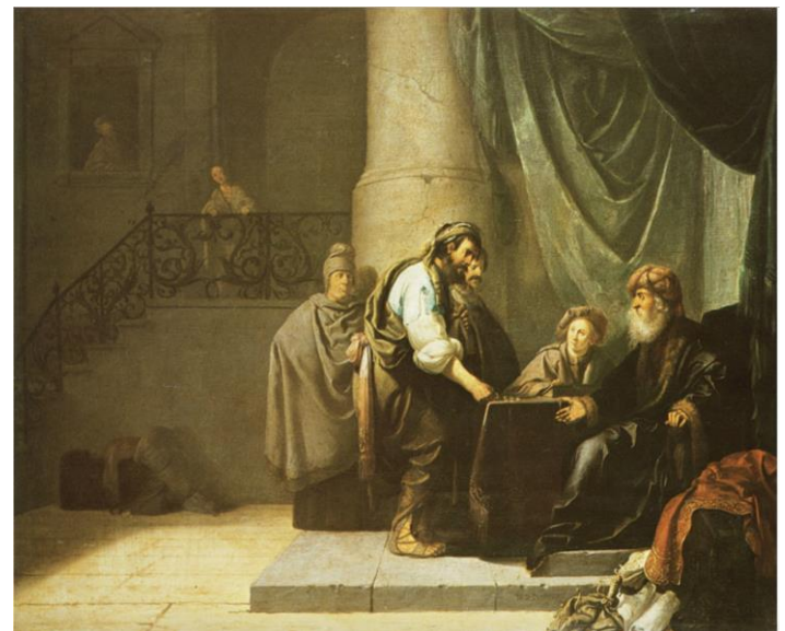
Parable of the Talents, Willem de Poorter (1608-1668)