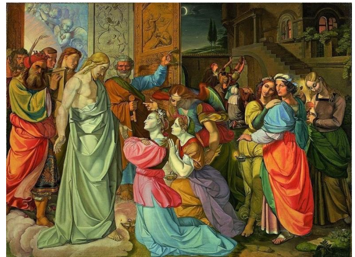
The Parable of the Wise and Foolish Virgins, Peter von Cornelius