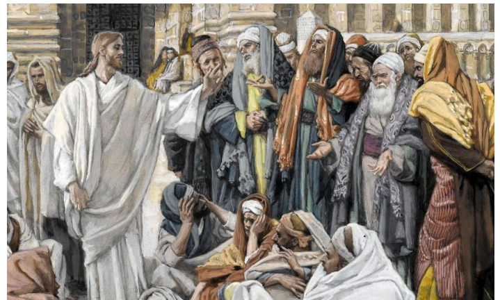
Jesus Disputing with the Pharisees