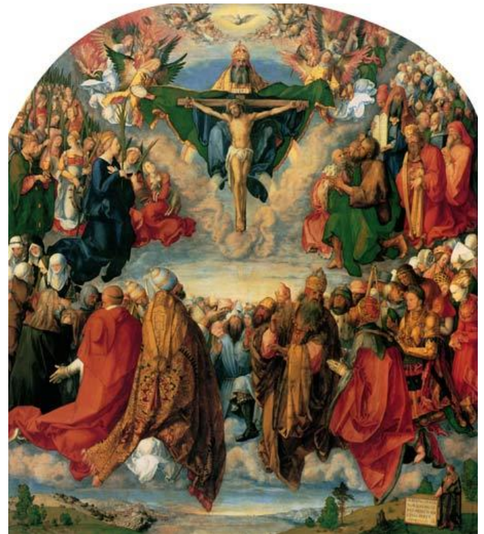
The Landauer Altarpiece, The Adoration of the Trinity, Albrecht Durer 1511