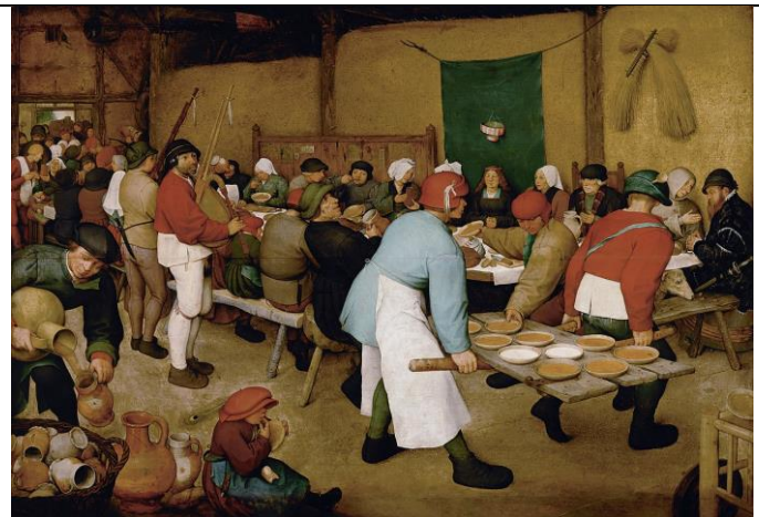
The Peasant Wedding, Pieter Breughel the Elder, 1567

The Harvest, the Fruits of Human of Work, the Reverent Use of Creation, Students and Teachers, the Spread of the Gospel, Justice and Peace in the World, Prisoners and their Families, All Victims of War, Young People