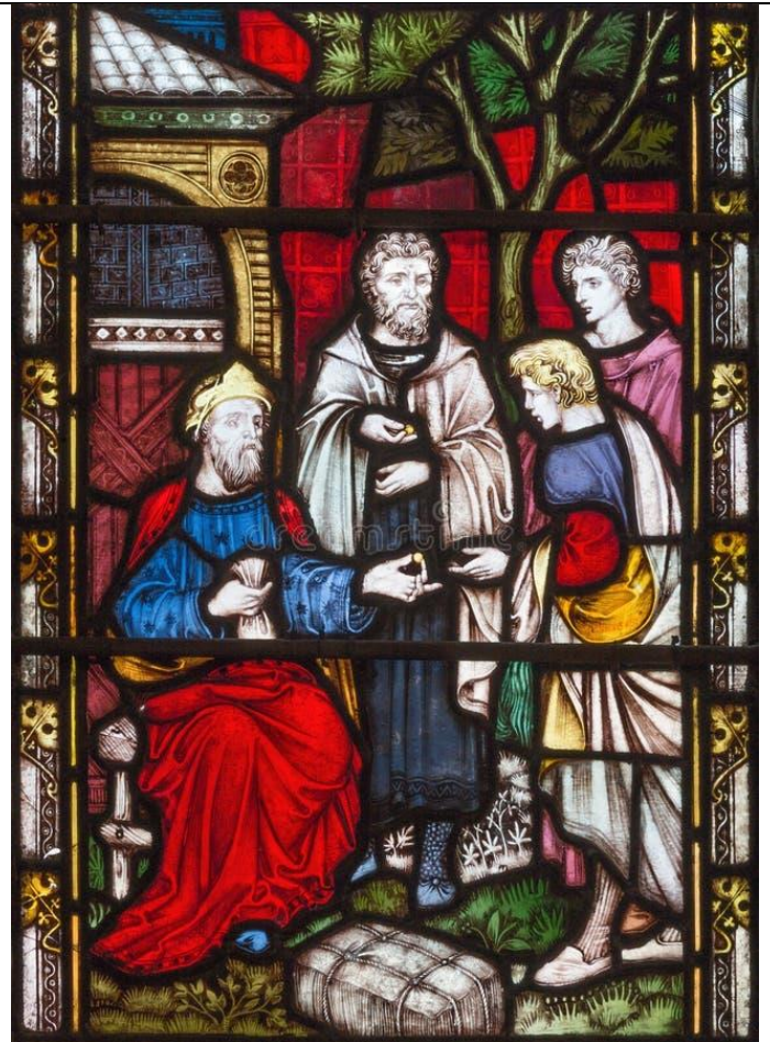
Parable of the Talents