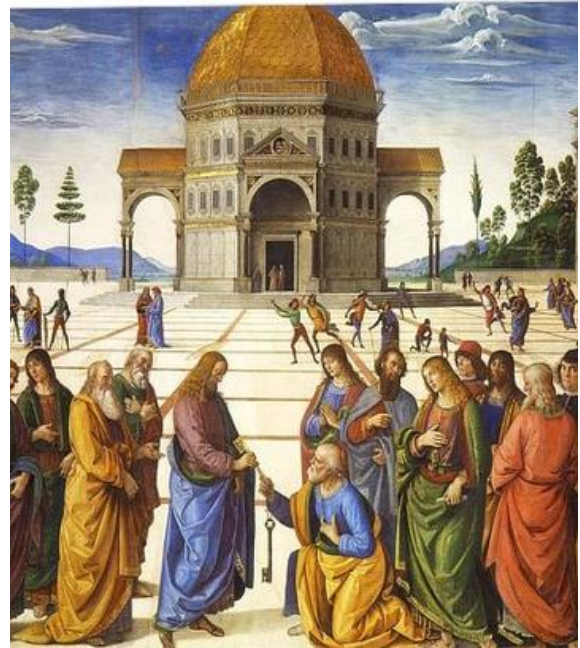
Christ Handing the Keys to St. Peter, Pietro Perugino 1481-82

A Deeper Understanding between Christians and Jews, Those who suffer Persecution, Oppression, and Denial of Human Rights, Europe, Human Life, Seafarers