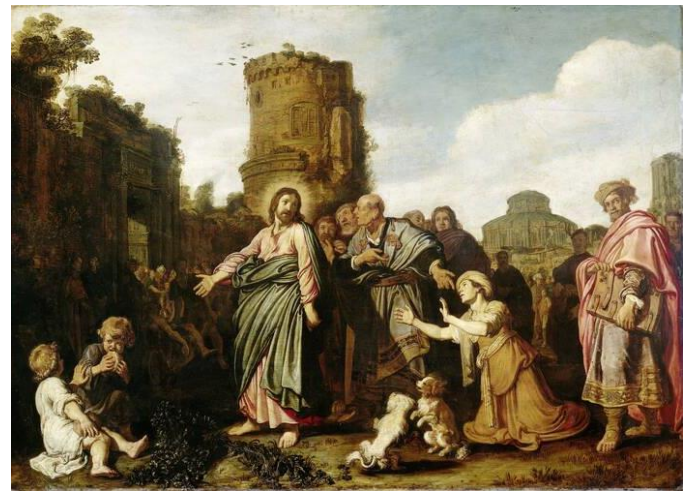
Jesus and the Canaanite Woman, Pieter Lastman, 1617