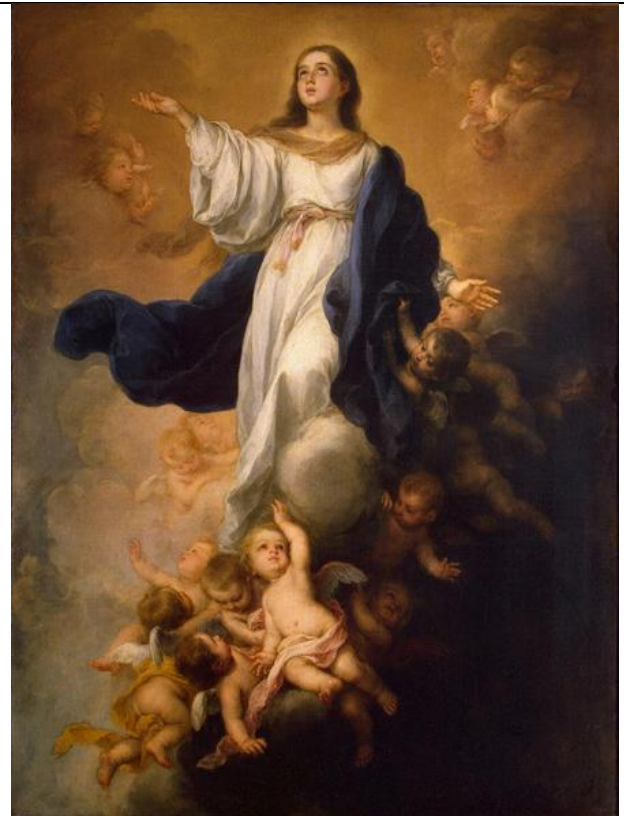
The Assumption, Murillo 1670