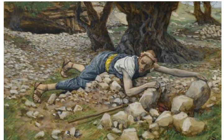
The Treasure Hidden in a Field

A Deeper Understanding between Christians and Jews, Those who suffer Persecution, Oppression, and Denial of Human Rights, Europe, Human Life, Seafarers