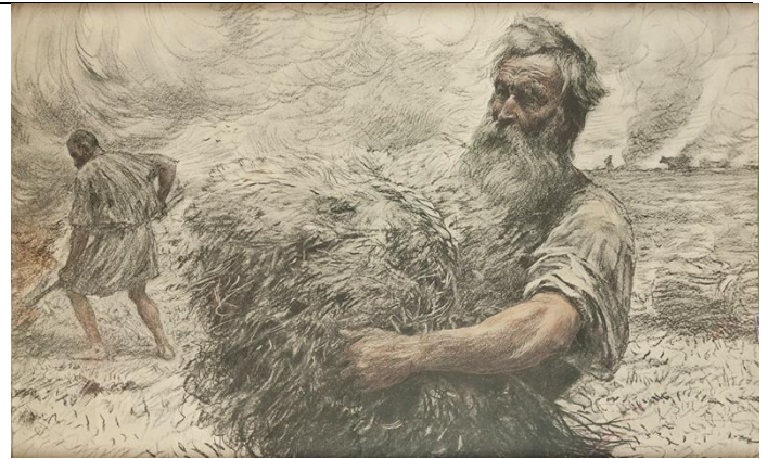
Burning the Darnel