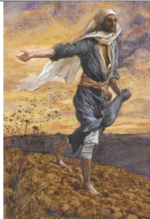
The Sower, James Tissot 1836-1902