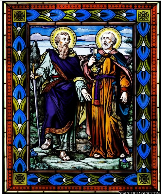
SS Peter and Paul