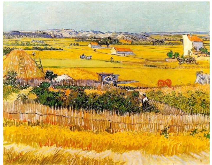
The Harvest at La Crau, Vincent van Gogh, 1888