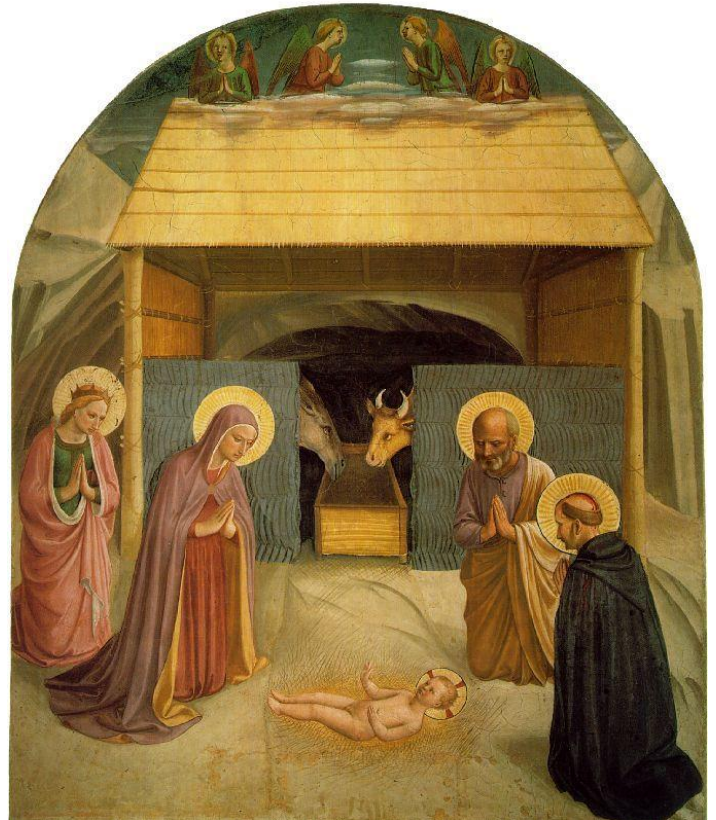
The Nativity, Fra Angelico 1439-43