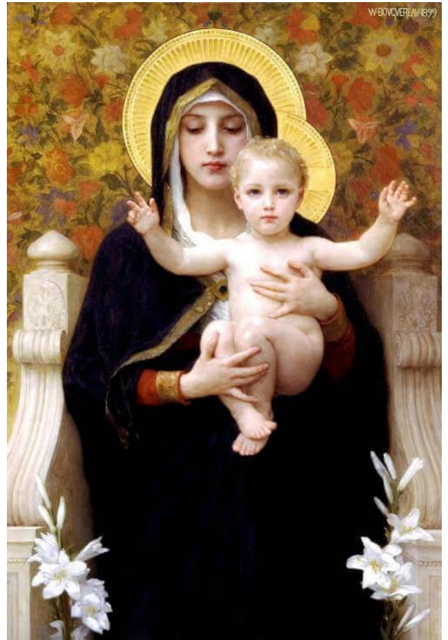
Mary, the Mother of God