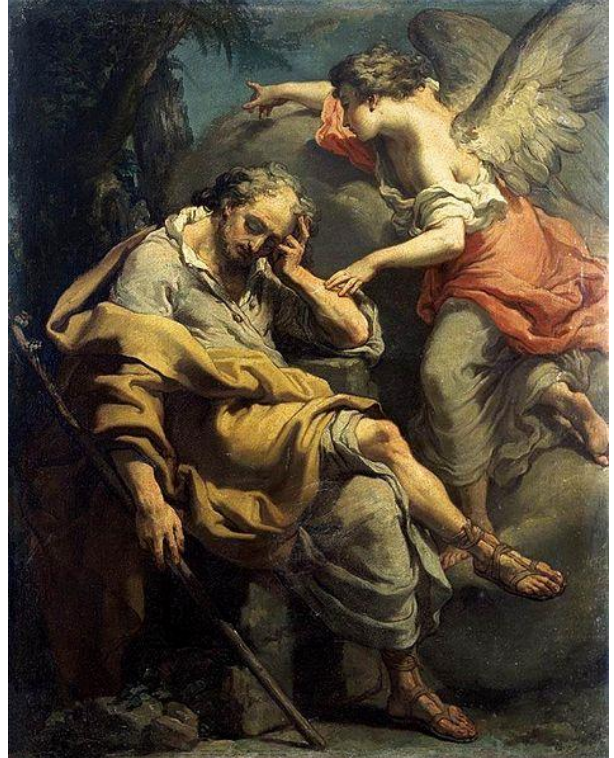
St Joseph's Dream, Gaetano Gandolfi 1734-1802