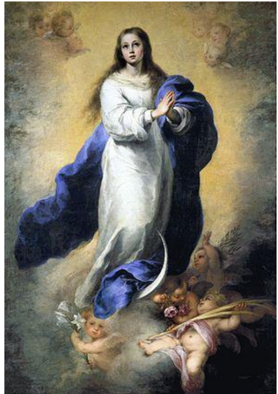
Immaculate Conception of El Escorial, Murillo 1660-1665