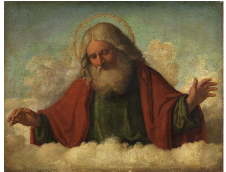
God the Father, Cima da Conegliano (1510-1517)